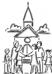
Invite a Neighbor to Church

So reach out – offer to drive them, take them out to lunch after... bring a friend to church any Sunday, but especially on September 25 th .