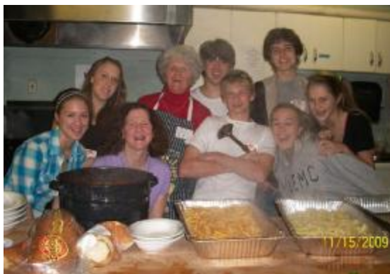
Some of the volunteers and Mission Trippers in the kitchen at the Pasta Dinner Fundraiser