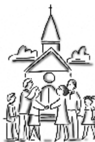
Invite a Neighbor to Church

So reach out – offer to drive them, take them out to lunch after... bring a friend to church any Sunday, but especially on September 28.